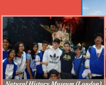
Natural History Museum (London)