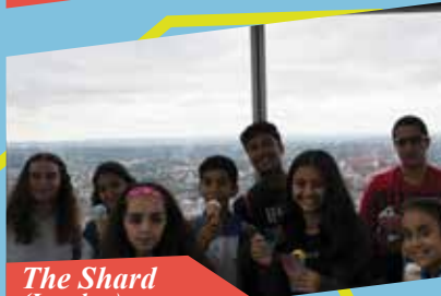
The Shard (London)