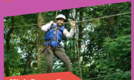
High Ropes Course