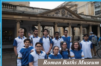
Roman Baths Museum