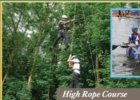
High Rope Course