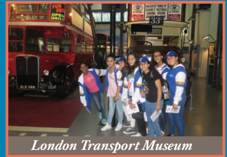
London Transport Museum