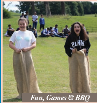
Fun, Games & BBQ