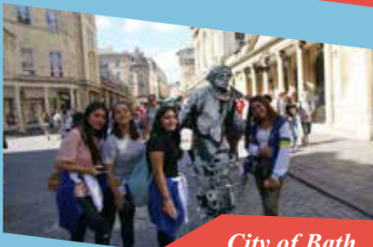
City of Bath