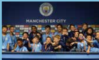
Manchester City Performance Programme