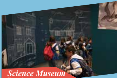
Science Museum (London)