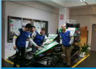
University Of Bath

"You have probably heard of the phrase, 'a picture is worth a thousand words' well a university visit is worth a thousand brochures. There is no experience like visiting a British university campus. Thank you to the summer camp which allowed me to visit two of the top ranked universities in the U.K."