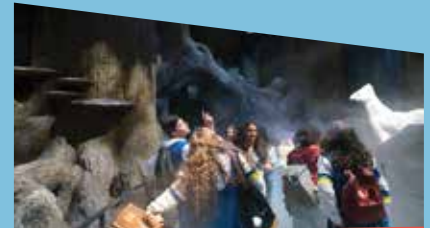
Warner Bros. Studio Tour London - The Making of Harry Potter