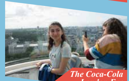
The Coca-Cola London Eye