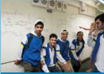
University College London