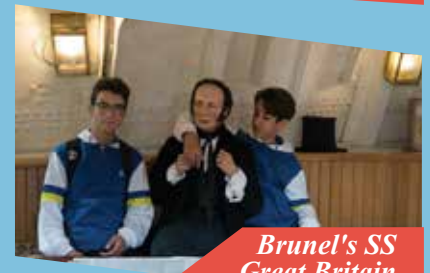
Brunel's SS Great Britain