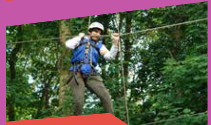
High Ropes Course